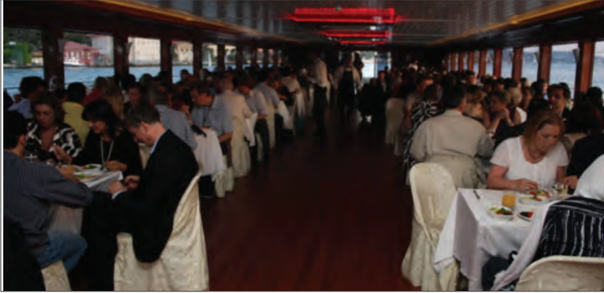
A scene from the Bosphorus boat tour. The participants enjoyed passing from Asia to Europe during the meal.