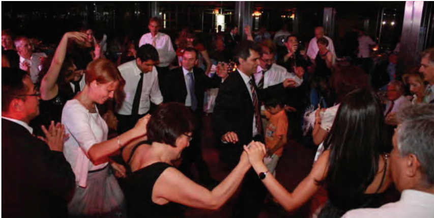
The participants enjoying the Gala Dinner party.

in the quiz. A certificate and small prizes were presented to both the teams and the winner of the audience after the session.