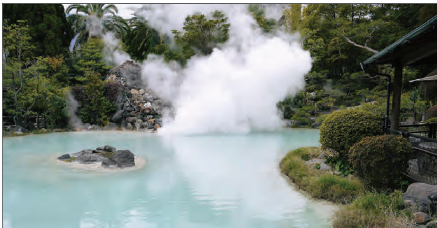
The Jigokudani hot spring in Beppu, Kyushu.

allowed to wear a swimming suit in the hot springs. As they say, “When in Rome, do as the Romans do”. Will you try? The Jigokudani hot spring in Beppu, Kyushu is only 2.5 hours away from Hiroshima by Shinkansen (Bullet train) and the usual express train. I recommend Beppu, as one of the best hot springs for foreign visitors to enjoy.