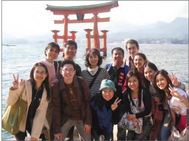
Miyajima Island. Khon Kaen friends in front of the Big Torii in the sea.

island of Miyajima (also called Itsukushima) has been worshipped as a god. This belief, passed down from generation to generation, has protected the Itsukushima Shrine, as well as the many other shrines and temples that are unique to the island's culture, and