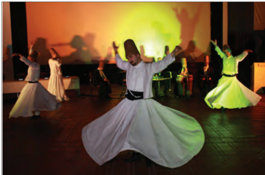
The whirling dervishes during the opening ceremony.

In Europe, the most important event for the Dentomaxillofacial Radiology community in 2010 was the 12 nd European Congress, held in the beautiful city of Istanbul from June 2-5, 2010. The ECDMFR congress welcomed over 400 participants from 24 countries. Overall 290 abstracts were submitted to the congress, from this 260 were accepted to be presented. Throughout the congress, there were 84 oral presentations and 176 posters from all fields of dentomaxillofacial imaging. However, due to restricted time and space, many papers submitted for oral presentation had to be assigned for poster presentations. The general standard of the papers was high. Moreover, as the main aim of the Local Organizing Committee was to invite experts from scientific discipline adjacent to radiology, nine keynote lectures from not only Europe, but also from USA and Japan, were invited to present lectures on different topics.