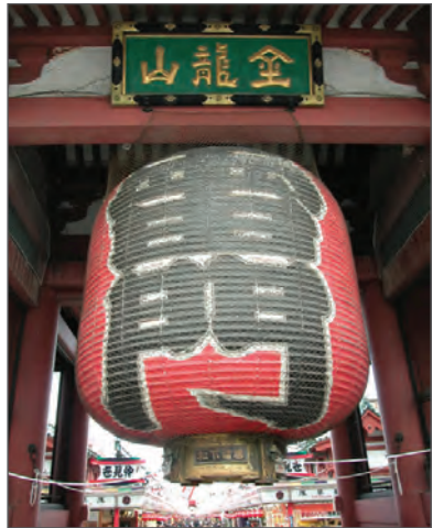
The gate of Sensoji Temple, Asakusa Kaminari-non in Tokyo.

As you know, Japan is a beautiful country with breathtaking scenery, centuries of history and stunning architecture. There are many great places you can visit when you are in Japan.