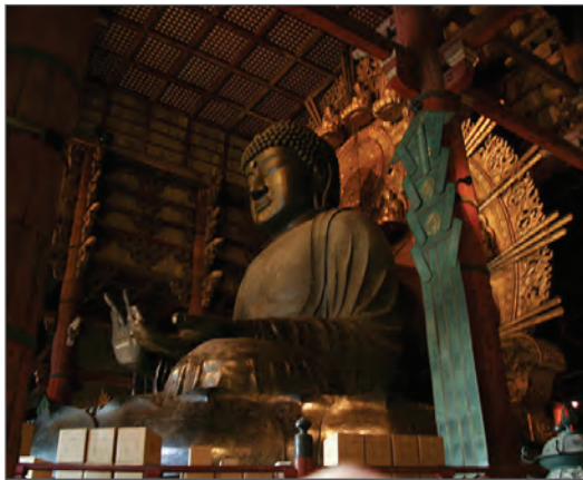
Daibutsu, Big Buddha in Nara.

around. Many old famous temples and ancient burial mounds are scattered in that area. The Daibutsu, Big Buddha, which is about 15 meters tall, is one of the remarkable sites in this ancient city.