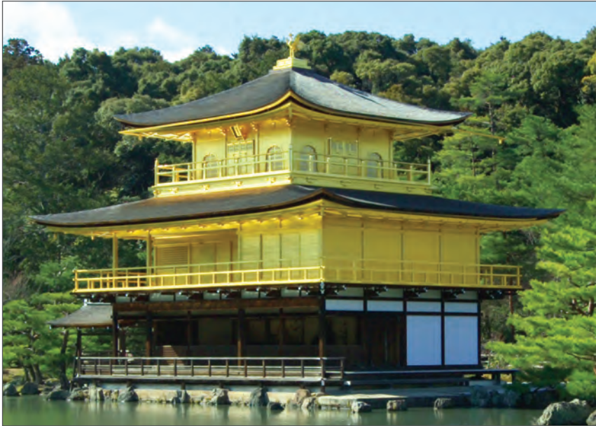
Kinkaku-Ji (Golden Temple), Kyoto.