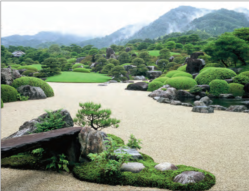
Serenity and beauty - the Japanese garden. Adachi Museum of Art.

We are planning a trip to Adachi Museum of Art as an optional post-congress tour. It has been awarded the title of the best Japanese garden for the last seven years, and it is situated northeast to Hiroshima. It takes four hours from Hiroshima by bus (coach). In addition, they will open a new exhibition area for modern Japanese art this fall. You will stay at the Onsen Ryokan,