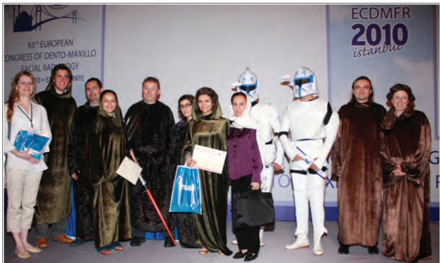
Participants and the judges from the special Junior Film Reading Session which was themed "Star Wars".